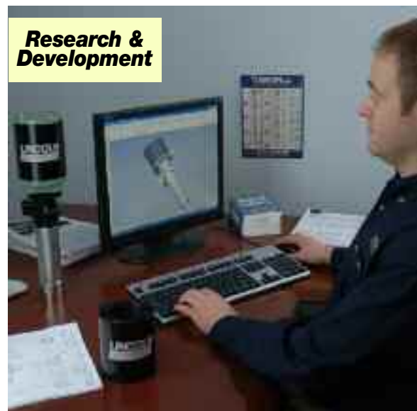
Research & Development