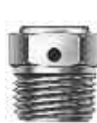
Pressure Relief Fitting