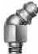
Stainless Steel Fitting