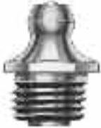
Thread Forming Fitting