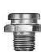
Standard Button Head Fitting