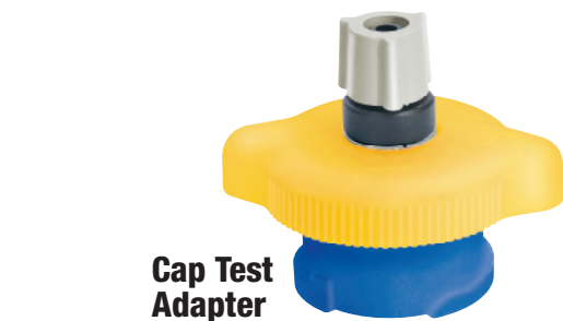
Cap Test Adapter