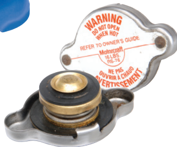
Common Radiator Cap

Motorcycles and other liquid-cooled sports and utility equipment including snowmobiles, ATVs, PWCs, forklifts and compact tractors share a common radiator cap configuration. The MV4510 has a specially designed low-profile cooling system adapter that fits in place of the cap, making pressure testing these vehicles quick, clean, and effective.