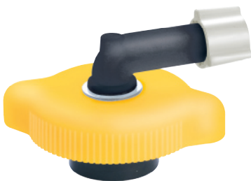
System Test Adapter