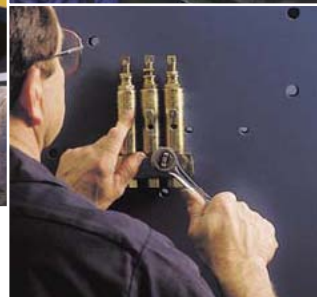
Over 1000 dedicated people worldwide work for Lincoln Systems