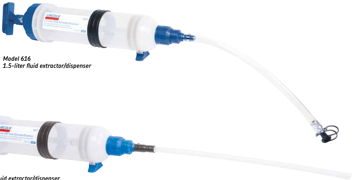
Model 616 1.5-liter fluid extractor/dispenser