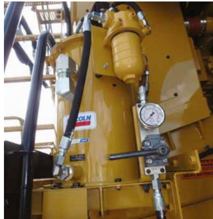
The mechanically operated, easy-to-install overflow prevention system is compatible with any pump using a Lincoln FlowMaster reservoir.