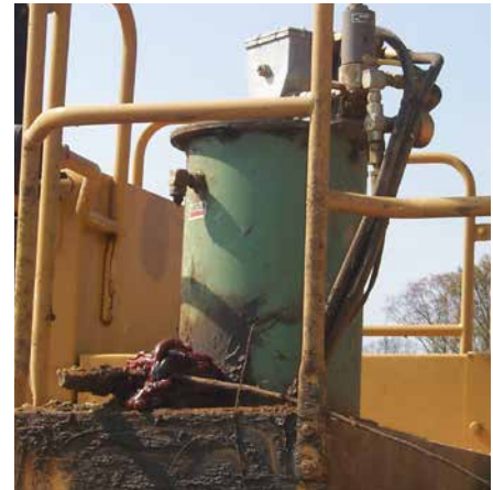
Example of reservoir overflowing that can cause slip-and-falls, fire hazards or other concerns.