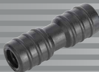
Model MVA7218 ATF adapter connector