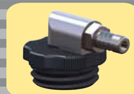
Model MVA665 90-degree Adapter