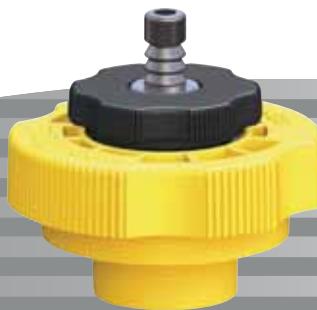
Model MVA661 GM Adapter