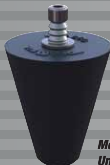
Model MVA660 Universal Adapter