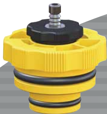
Model MVA662 Ford Adapter

Featuring a robust design and construction, all three adapters include an inline, barbed connection for a 1/4 in. internal diameter hose. A 90-degree barbed connector, MVA665 , is available separately and can be interchanged with the inline connector on MVA661 and MVA662 for applications with limited overhead.