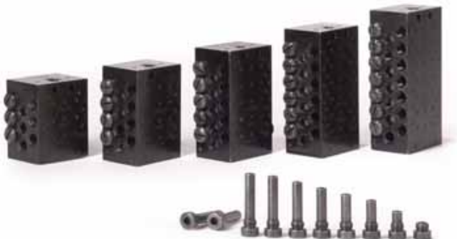
SSV-D Divider Blocks with Metering Screws

SSV-D metering devices are adjustable per outlet pair thus enabling an accurate matching to lubricant requirements. The metering occurs within the metering block via metering screws that are available in 10 different sizes.