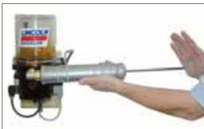
Filling of Quicklub Pumps: Fast & Easy

Ideal for individual machines or groups of machines Quicklub Systems have been designed to meet the toughest requirements of agricultural machines and equipment. Their operation is based on the reliable progressive principle in which the lubricant is dispensed by a piston pump via progressive plunger metering devices to the lubrication point. The lubrication occurs in metered, timed intervals at a maximum pressure of 350 bar. Thus the lubrication of bearings with high back-pressures is also guaranteed. The pump can serve up to three independent circuits, each with its own pump element, consisting of numerous lubrication points with lubricant. The system is easy to monitor and ensures that the right quantity of grease is supplied to the lubrication points