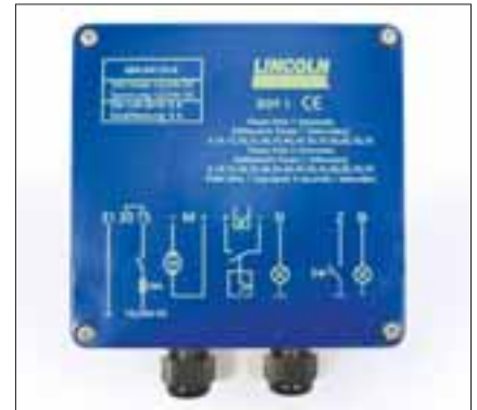
EOT – the EOS Controller

The metering elements supply the required oil quantity in timecontrolled intervals to brushes or felt pads which evenly apply the oil to the chain. The required metered quantity of oil can be adjusted to properly match the working condition, the size and length of the chain.