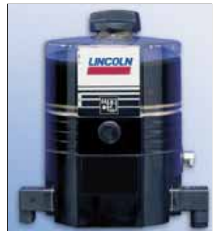
QLS 311 – Oil Pump with Filling from the Top, with Float Switch