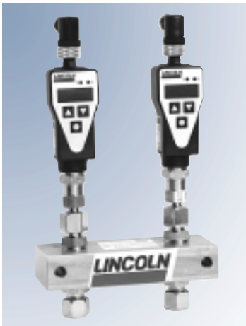
Electronic Pressure Unit 632-36627-1

Electronic end-of-line pressure unit for the control and monitoring of two-line systems