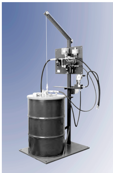
SAF Pump with Stand and Winch (Drum Supplied by Lubricant Supplier)

These pneumatic barrel pumps, SAF1-YL with one outlet and SAF2-YL with two outlets are designed for use in spray systems for the supply of adhesive lubricants (NLGI 0 and 00). SAF pumps are placed directly into 200 liter drums. They do not require a follower plate, thus the supply of lubricant is possible even if the drum is severely dented. With the aid of an optional stand and winch unit, it is easy to exchange barrels.