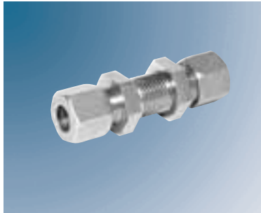
Bulkhead Fitting Straight