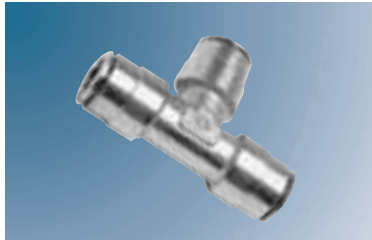
T-Piece, Push-in Type, with Knurled Collar

Note: Use only for combining two lubricant quantities, either from the main metering device to a secondary metering device or back to the pump. Designed for high-pressure plastic hose (8.6 x 2.3 mm) with hose stud and groove.