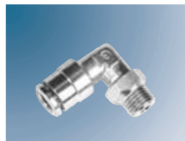
Elbow, Push-in Type, Rotatable, with Reinforced Collar

Important: Use this fitting only for the connection of the lubrication points, if the pressure plastic tube (6 x 1.5 mm) will be replaced by high-pressure plastic hose (8.6 x 2.3 mm).