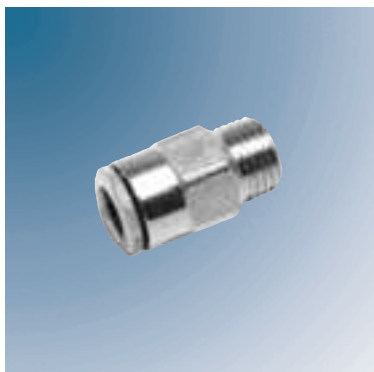
Male Connector with Knurled Collar

Note: M = metric, R = BSPT, G = GSPP, K = conical