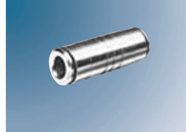
Line Connector Union, Push-in Type

Note: To be used for the repair of high-pressure plastic hose and pressure plastic hose.