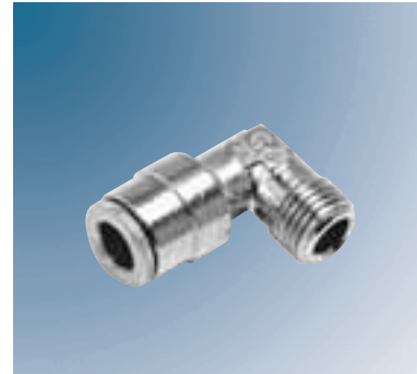
Elbow, Push-in Type, with Knurled Collar