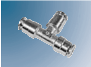
T-Piece, Push-in Type Reinforced