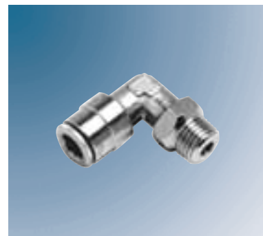
Elbow, Push-in Type, Rotatable, with Knurled Collar

Note: Use only for occasional rotary motions, pivoting angle < 180°. For other applications use a straight rotary swivel, 90° or a similar fitting.