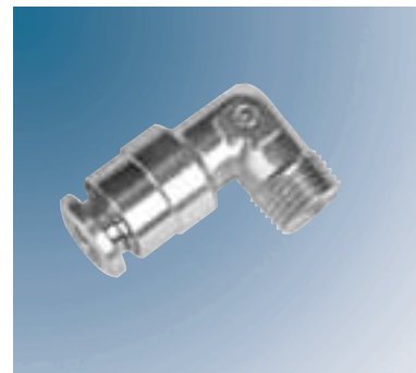
Elbow, Push-in Type, with Reinforced Collar

Important: Use this fitting only for the connection of the lubrication points, if the pressure plastic tube (Ø 6 x 1.5 mm) will be replaced by high-pressure plastic hose (Ø 8.6 x 2.3 mm).