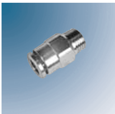
Male Connector with Reinforced Collar