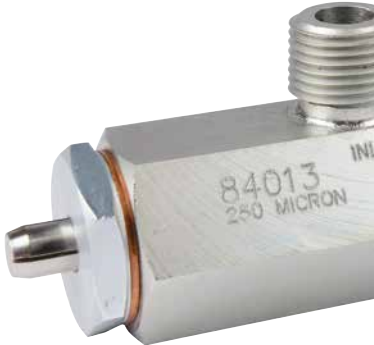
Visual indicator of clean filter element In extended position