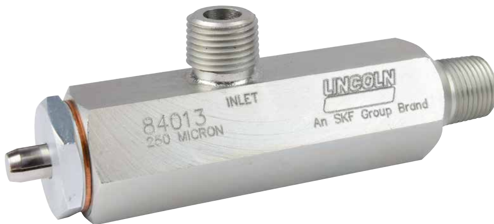
Small grease reservoir filling filter 84013

The Lincoln small grease reservoir filling filter was developed to minimize contaminants entering the automatic lubrication system during the fill process of smaller-sized reservoirs. Part of SKF's family of grease filtration products, the filling filter helps to ensure the system starts the lubrication process with clean grease.