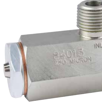
Visual indicator of clogged filter element In retracted position