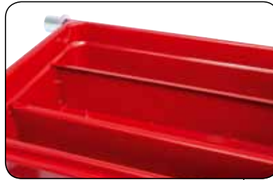
Internal baffles prevent sloshing and spills