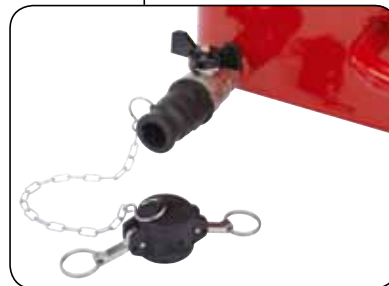
Includes ball valve and \frac{3}{4} in. cam lock style coupler with leak-proof cap