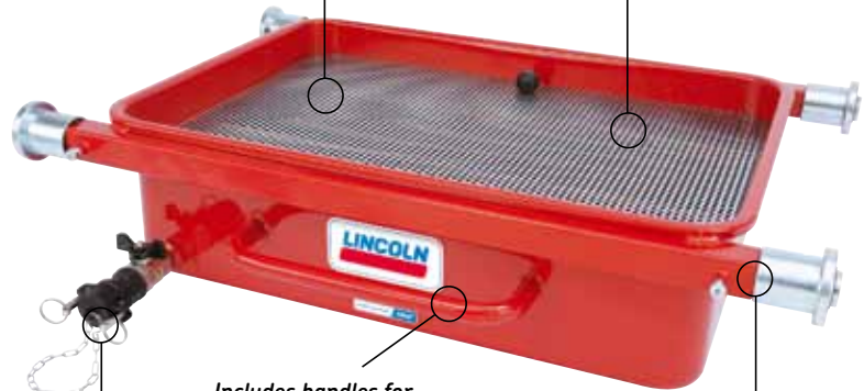
Includes handles for maneuvering and support