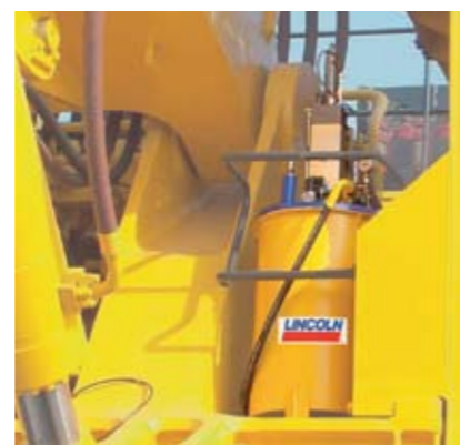
Factory-installed auto lube system using a hydraulically driven grease pump with a refillable sealed container