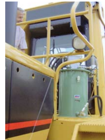
Grease pump and refillable sealed container reduce contamination potential

The SSV progressive metering devices are a solid-block type with a high-precision piston fit that eliminates the need for defect-prone rubber seals. They