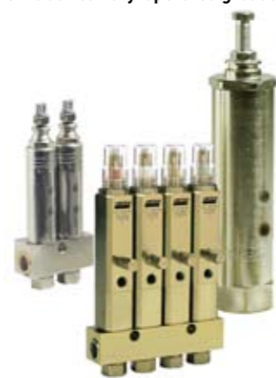
CentroMatic single-line injector family