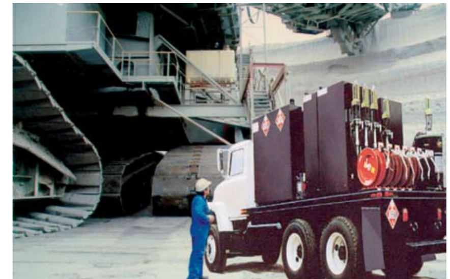
Mobile service unit furnished with Lincoln pumps and equipment is used to fill all oils and lubes on the large reclaimer