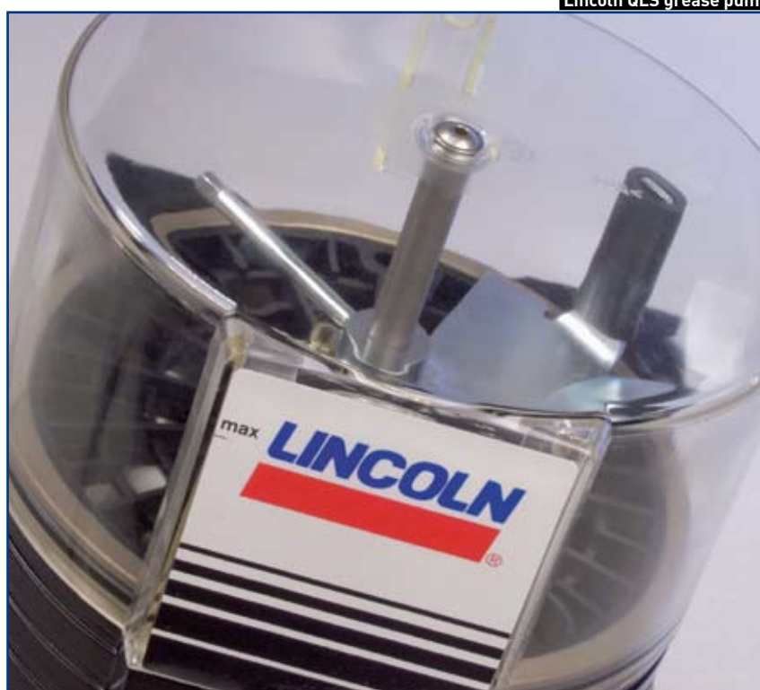
Lincoln QLS grease pump

Harsh conditions such as water, dirt, dust and mechanical loads cumulatively