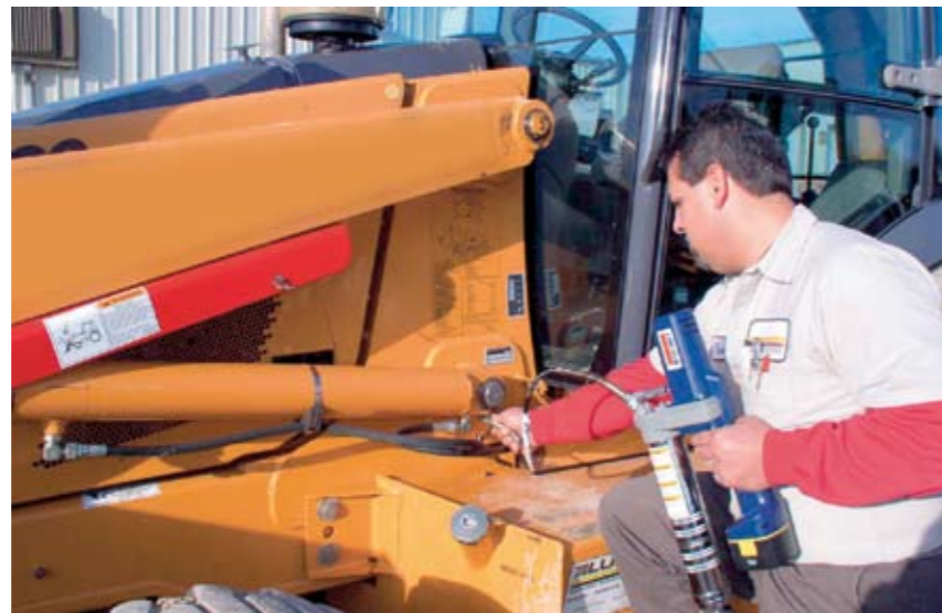
BDS – from one central point, several lube points are easily treated, such as with this Lincoln PowerLuber battery-operated grease gun

The Lincoln BDS is based on a modular building block concept that can be extended at any time, or retrofitted with an automated centralised lubrication pump. This provides the owner with a flexible and economic solution.